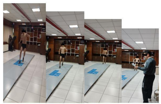
Figure 3. Performing a maneuver to change of direction on the force plate

Next, kinetic parameters in the anteriorposterior, mediolateral, and vertical directions as well as the amount of incoming stress were assessed using a Swiss-made Kistler-9260AA6 force plate angle (Figure 2) and Cortex software.