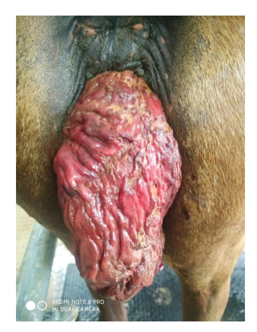
Figure 2. Prolapsed mass shows various multifocal yellowish and greyish areas, along with edema and congestion