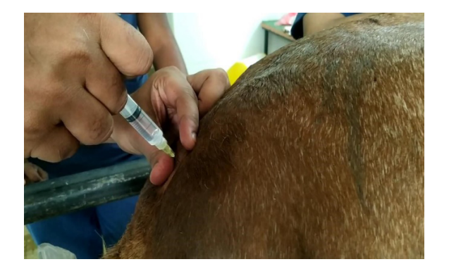
Figure 3. Epidural anesthesia at inter-coccygeal space using 2% Figure 4. Application of salt to reduce edema lignocaine