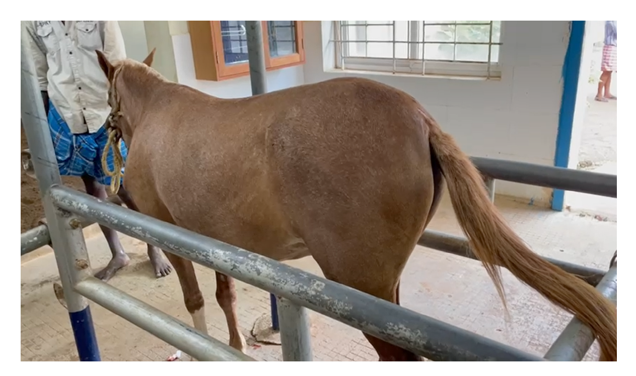
Figure 7. Uneventful recovery

The animal was administered with flunixin meglumine (1.1 mg/kg intravenously), oxytocin (40 IU intramuscularly), and a combination of streptomycin (20 mg/kg) and procaine penicillin (22,000 units/kg). The animal exhibited urination and mild straining after oxytocin administration; however, the uterus did not prolapse again. On a subsequent day, all vitals were normal. The congestion of the mucous membranes was reduced. Fluids were administered again, along with non-steroidal anti-inflammatory drugs (NSAID) and antibiotics. Intrauterine antiseptic douching using a diluted 5% povidone-iodine solution was performed. Upon vaginal speculum examination, cervical involution was appreciable. The antibiotic and NSAID were continued for five days and the mare had an uneventful recovery (Figure 7).