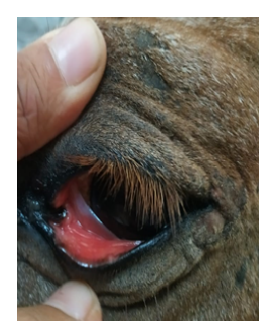
Figure 1. Congested mucous membranes