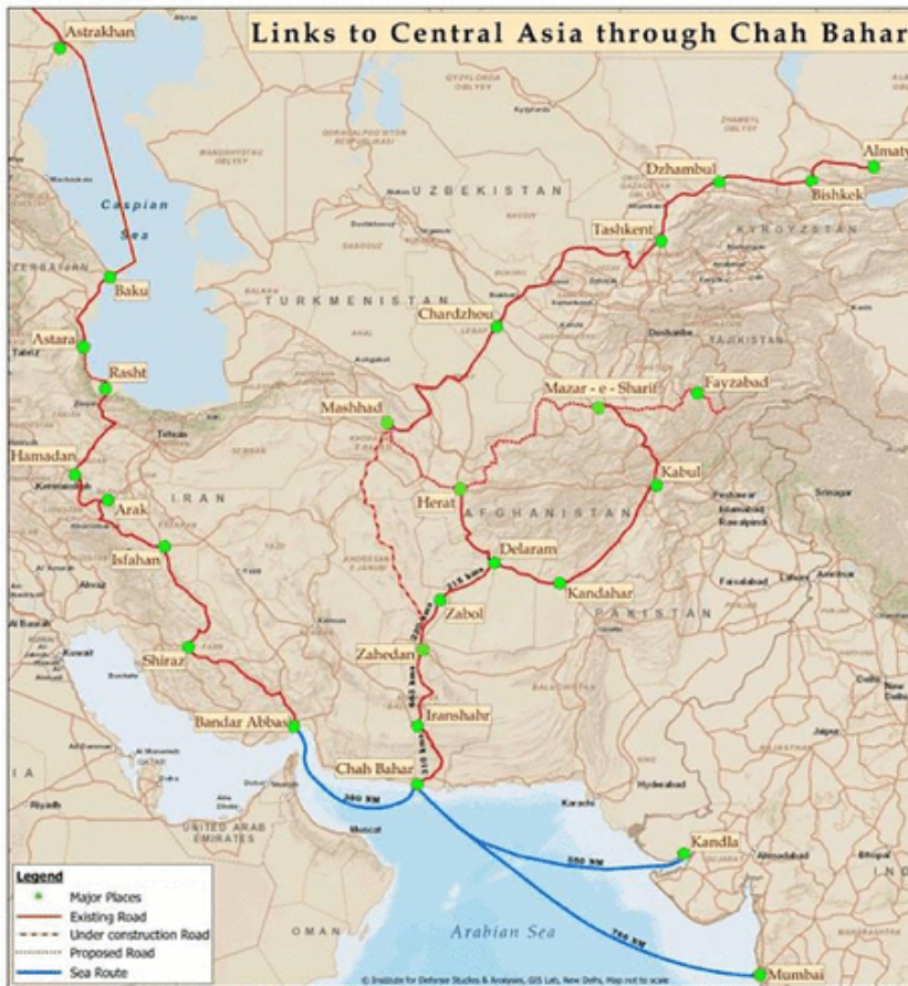
Figure 2. Iran's Facilitating Route to Gain Access to Eurasia and Central Asia

to the issue of reducing effective and fast access to the Eurasian region, which has made this country worry that in the absence of the competition formed in Iran, it will be surrounded by its main competitor, China in the future, as China has gained extensive control over access routes to the Eurasian region. In other words, this issue can change into a very important factor, which can threaten India's national interests and in the long run, lead to China's geopolitical superiority (Chaudhury, 2016a).