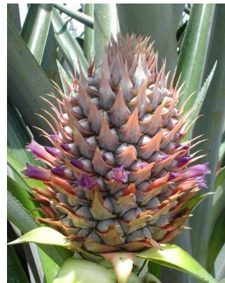
(b) Middle whorl ( 70 DAF)