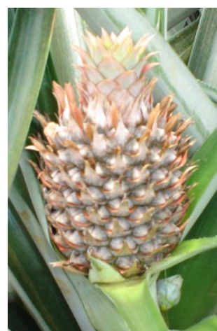
(d) Dry petal stage (79-90 DAF)