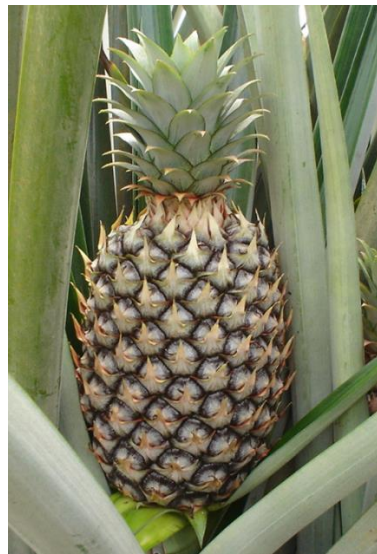
(a)-110 days after forcing