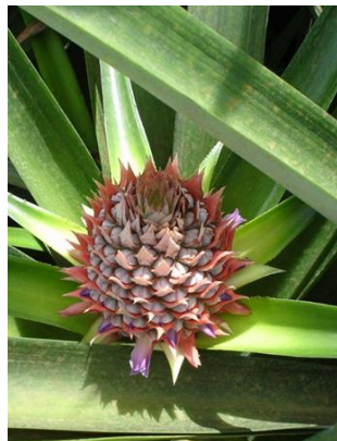
(a) Early whorl ( 65 DAF)