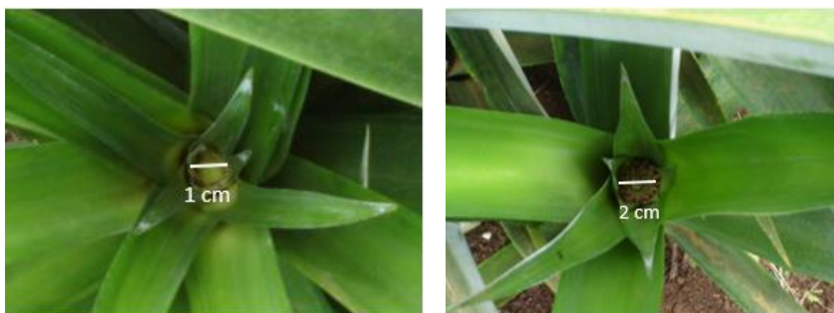
(a) 1 cm red inflorescence