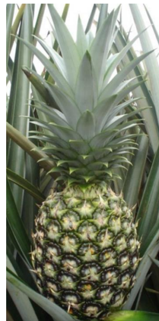
(d)-175 days after forcing