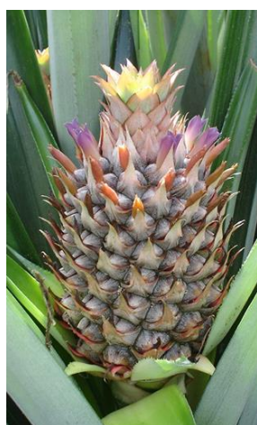
(c) Last whorl ( 75 DAF)