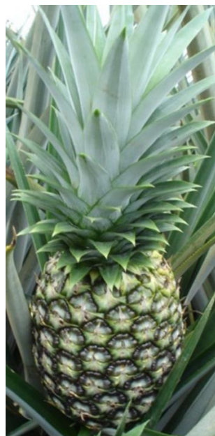
(c)-155 days after forcing