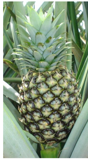
(b)-125 days after forcing