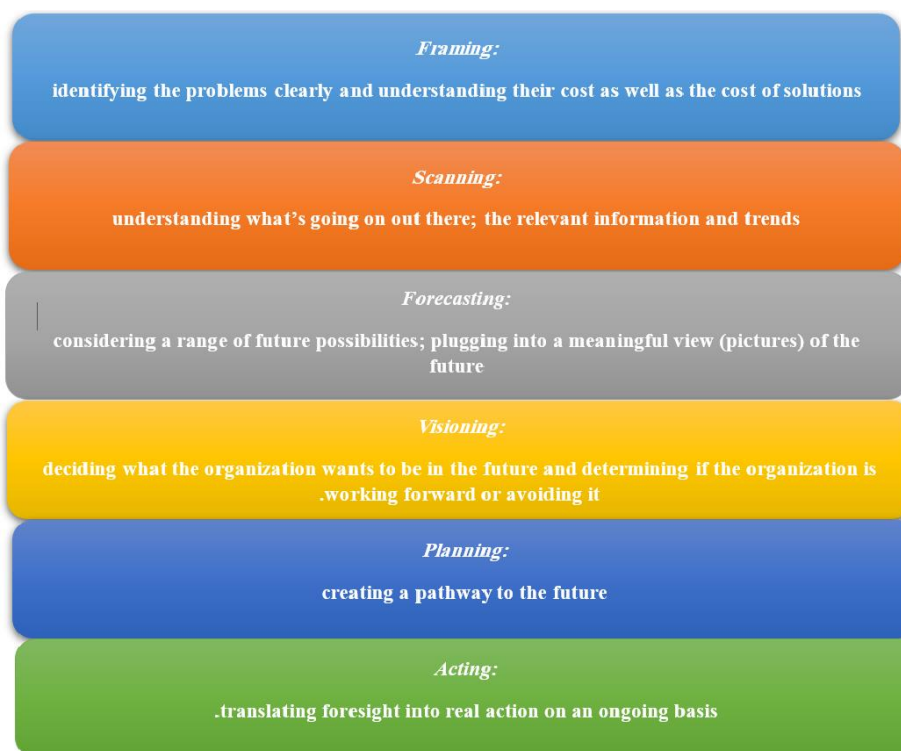
Figure 1. Strategic Foresight process [9]

and household income [12]. In examining the factors influencing the future of Iran's sports, other factors can be added.