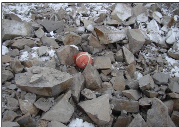
Figure 3. Fragment dimensions resulting from blasting the porphyry zone