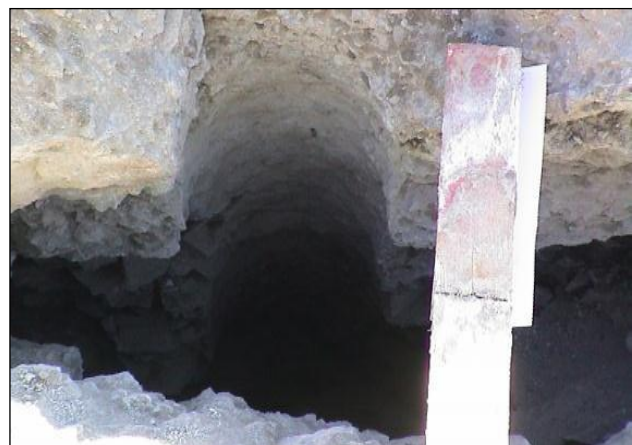
Figure 2. A blast hole in Sungun copper mine

Given the request of the Mine & Contractors Affairs, the designed blasting pattern was executed using the slanted method for 127 mm diameter in the porphyry and dyke zones and the vertical method for 165 mm diameter in the trachyte zone. An example of blast holes drilled in the Sungun mine is shown in Figure 2.