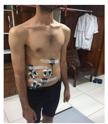
Figure 1. Position of electrodes on the selected muscles

At the earliest stage, which coincided with the end of each attempt by the subject, the EMG signals, check and its initial accuracy were confirmed [25]. The noise from the EMG signals was removed, using a band pass filter between 10 and 500 Hz. The method of Maximum Voluntary Isometric Contraction (MVIC) was used to normalize the RMS. For the duration of the electrical activity, each of the EMG signals was normalized to the maximum of the same signal. EMG signals were processed in a gait cycle using MATLAB software.