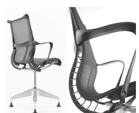
Figure 3: Multipurpose Chair by Herman Miller

The technical aspects of products need to be completely controlled by engineers. Aesthetic and functional aspects of products can be expressed through material selection. According to researches, easy and cheap production based on aesthetic and emotional needs, is a criterion to choose one material over the others (Adabi, 2016). It is believed that both aspects of aesthetic and function are influenced by cultural context. From this point of view, material selection can also be affected by culture. An appropriate material selection could, therefore, influence all aspects of a product. A material can make products beautiful, functional, ergonomic and usable. Since these factors have an impact on experience, material could be considered as an experience creator (Figures 3 and 4).