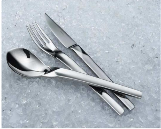
Figure 4: Shah Cutlery set