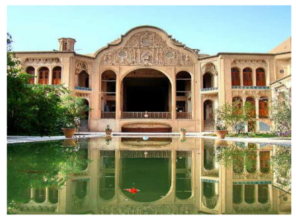
Figure 1: Borouierdiha House in Kashan, Iran

The existence of different design styles from past to the present seems to be another reason for the role and importance of culture on aesthetic. For example, the buildings in Figures 1 and 2 illustrate the architecture of two cultures. Investigating their aesthetic elements, there are no resemblances between the two buildings; however, they are both known as beautiful artifact in their own culture and time, having unique aesthetic features to tell them apart totally.