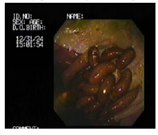
Figure 1 . 12 years old mare with gostric uncer (severity 2) and Gasterophilus spp.(botfly)

There is not any relation between presence of Gasterophilus spp. using anti-parasite drug (p=0.20) and gastric ulcer (p=0.8)