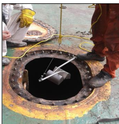
Fig. 2. Sediment sampling using grab