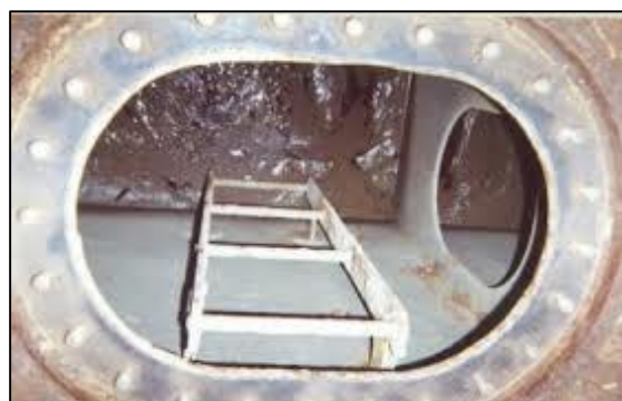
Fig. 3. Ballast water tank