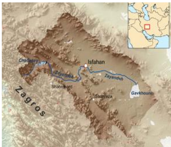
Fig .2.The study area

Zayandeh-Rood River originates from the western part of the Zardkoohcity and after passing a curved way of 420 km, reachesGavkhooni marsh in the east[TSY, 2012]. The amount of water increases before Zayandeh-Rood River reservoir due to the entering upstreams, and it gradually decreases when moving toward the river. The average annual flow in the first measuring station after the reservoir is 47.5 m 3 /s before arrival of the river to the city in the west. In Moosian station in the east, where the river leaves the city, the average annual flow is about 22.1 m 3 /s and finally in Varzane (the last station) it is 0.16 m 3 /s [TSY.2012]. Fig. 1 shows the study area.