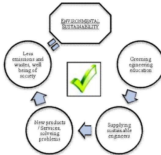
Fig. 1: Environmental sustainability through greening the engineering education.