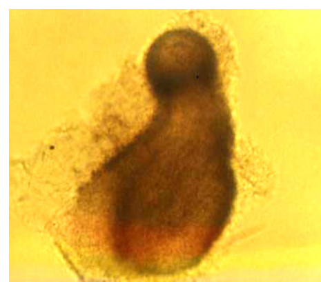
Maz-39 Magnaporthe TH16 ( x ) Mat1-2 grisea