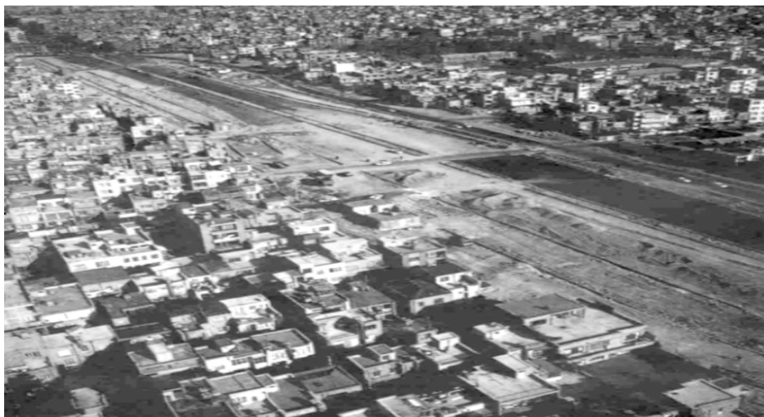
Fig. 2. A view of the demolition site in the Navab Project