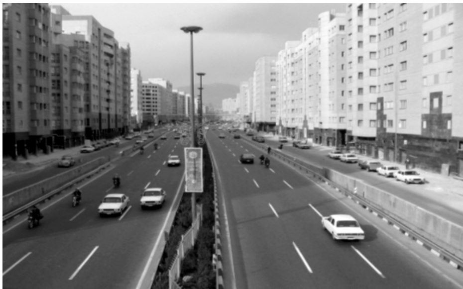
Fig. 4. A view of the built-up corridor of the Navab Project