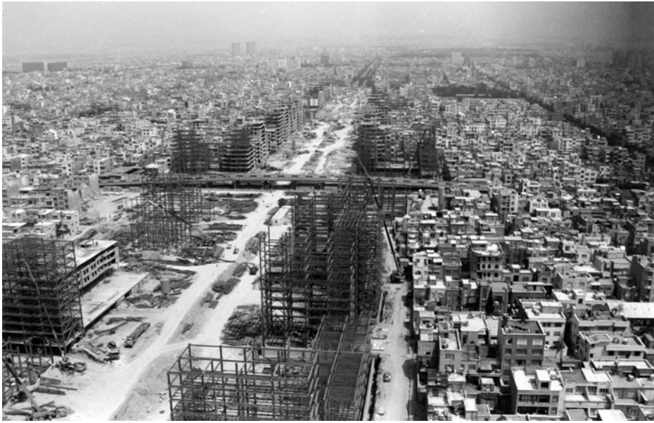
Fig. 3. Navab Project under construction